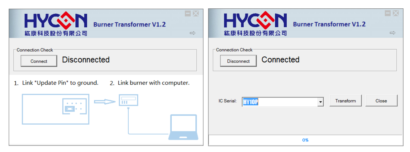
Fig. 5-2 Fig. 5-3

Connect the HY10000-WK08C integrated Writer through the USB cable to the computer (at this time Writer LED lights are all off), run "Burner Transformer.exe" to open the application, the interface as shown below, click the button "Connect".